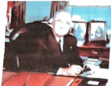
President Harry S. Truman.

What do you do in a day? Meet with your boss, employees, clients? Go out to friends? Go to the dentist, the grocery store, or school? Come see what President Truman did every day of his Presidency! Search for a specific day (what was Truman doing on your birthday?) or search for a specific person (how many times did President Truman meet with George Marshall?). President Truman also met with numerous everyday citizens during the course of his duties--did he meet with relatives? Search the calendar to find out!